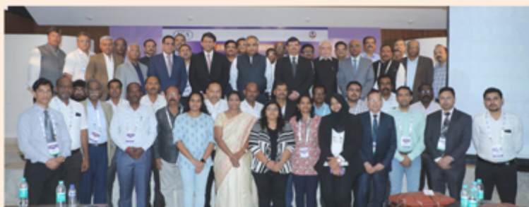
Batch of Participants and Trainers at Chennai (February, 2024)