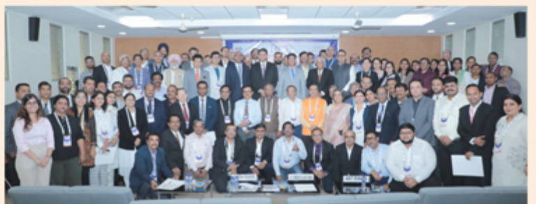
Batch of Participants and Trainers at Goa (December, 2024)

Goa (Dec 2024): In collaboration with Goa Bar Association; Keynote address by Hon'ble Justice M.S. Karnik, High Court of Bombay at Goa (Attended by Over 100 participants)